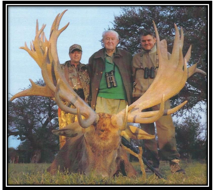
#3 South American 497 5/8

We recommend RIPCORD for your Rescue Travel Insurance. They provide a one-stop integrated travel protection program for adventurers and 24/7 contact with medical and security professionals. They are a medical and travel security risk company that provides worldwide evacuation and rescue services from your point of emergency all the way home. www.ripcordrescuetravelinsurance.com/portal/highmtnhunts