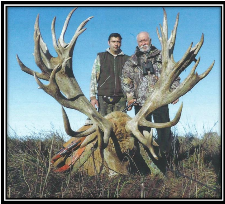
#1 South American Record 538 1/8